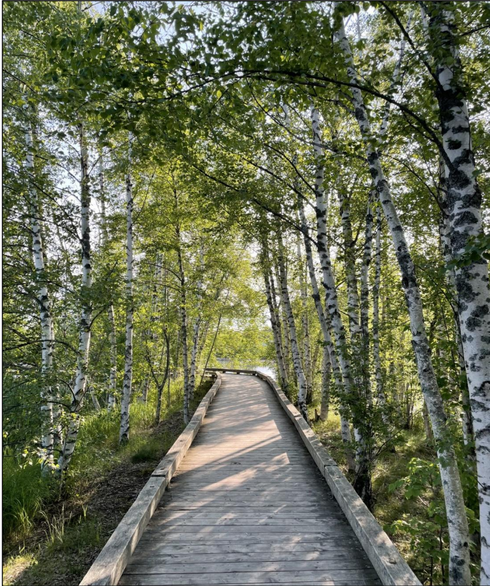
Photo Credit: Bronwyn Corlett, Sackville Waterfowl Park, Sackville, NS